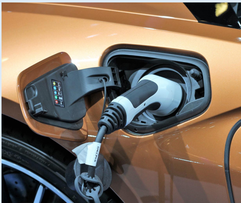
The BSRA Survey – Finding a solution to on-street Electric Vehicle Charging in our neighbourhood

As an ongoing and ever changing issue, we welcome constructive community comments, and we will keep residents updated. If you haven't already responded to the survey, it's not too late. We appreciate your attention, welcome your comments and suggestions, and look forward to receiving feedback at your earliest convenience so we can co-ordinate our community ideas.